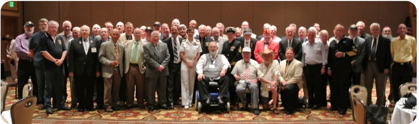
The official 2013 Reunion photo